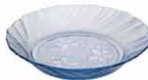
Color Sky Blue Sky Blue