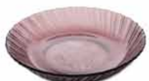
Color Uva Grape