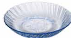
Color Sky Blue Sky Blue