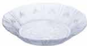
Color Cristalino Clear

Cap. 610 ml. / 20.7 oz. H: 3.8 cm Ø: 20.0 PxC/Box: 24 kgxC/Box: 10.700 kg. m 3 xC/Box: 0.0201