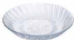
Color Cristalino Clear

Cap. 540 ml. / 18.4 oz. H: 3.5 cm Ø: 19.6 PxC/Box: 24 kgxC/Box: 10.360 kg. m 3 xC/Box: 0.0196