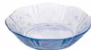
Color Sky Blue Sky Blue