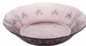
Color Uva Grape