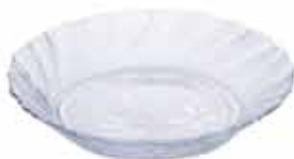
Color Cristalino Clear

Cap. 610 ml. / 20.7 oz. H: 3.8 cm Ø: 19.8 PxC/Box: 24 kgxC/Box: 10.400 kg. m 3 xC/Box: 0.0198