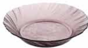
Color Uva Grape