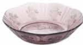
Color Uva Grape