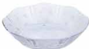
Color Cristalino Clear

Cap. 530 ml. / 18.5 oz. H: 4.4 cm Ø: 18.8 PxC/Box: 24 kgxC/Box: 10.830 kg. m 3 xC/Box: 0.0215