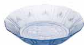
Color Sky Blue Sky Blue